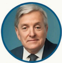
ANTÓNIO GUTERRES UN Secresary General